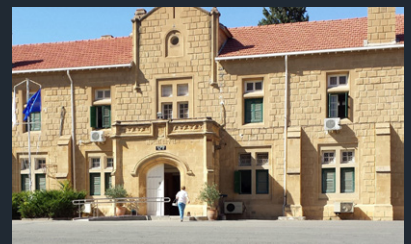
The Nicosia District Courts opposite the building