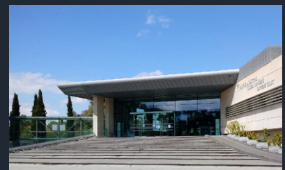
The Supreme Court of Cyprus opposite the building