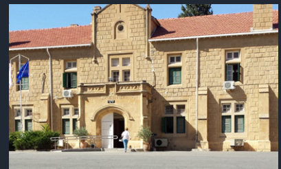
The Nicosia District Courts opposite the building